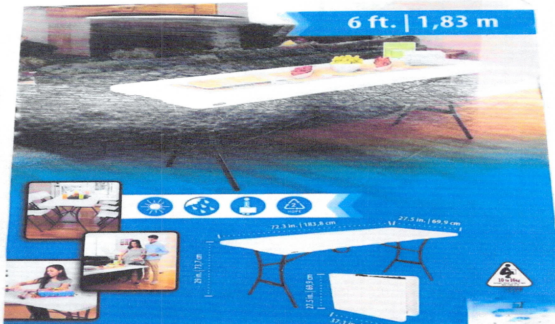
PHOTO OF FOLDABLE TABLE FOR REFERENCE

Changes to the activity dates have been made due to the suspension of work in government offices caused by the typhoon and continuous heavy rainfall.